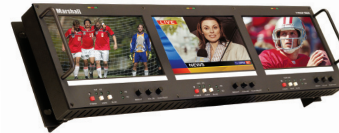
V-R653P-HDSI Users Guide

1910 East Maple Ave. El Segundo, CA 90245 Tel.: 800-800-6608 • Fax: 310-333-0688 www.LCDRacks.com Email: sales@lcdracks.com